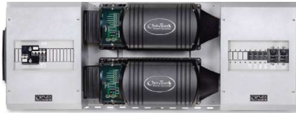
Grid-Tie Systems with Battery Backup (see table at bottom for batteries)